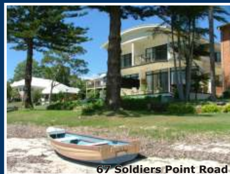
67 Soldiers Point Road

If you have been searching for a waterfront Bargain, look no further!