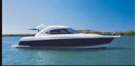
Australian Boat of the Year - Riviera 4700

Entry to the show is free and visitors will enjoy