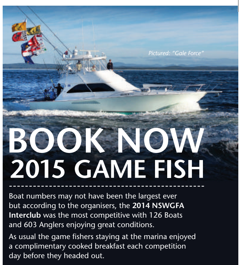
Pictured: "Gale Force"