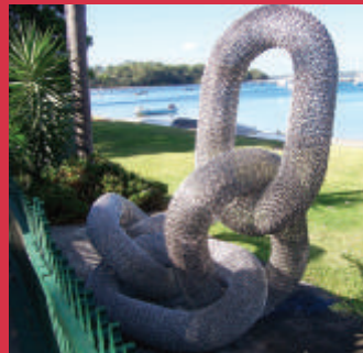
Chain Link Sculpture