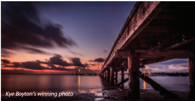
Kye Boyton's winning photo