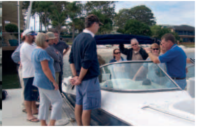
Complimentary Easter Boat Handling Clinic.