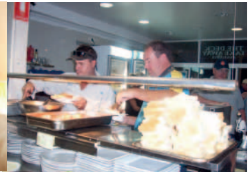
Game fishermen enjoying their complimentary daily breakfast before heading out.