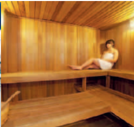
Always time to enjoy a relaxing sauna...