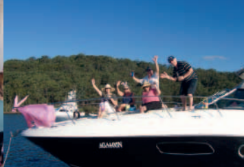
Easter Seafari - Music on the water.