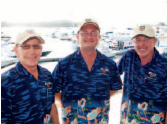
The best professional marina crew in the business