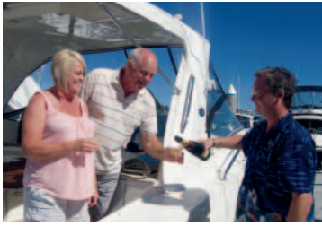
New Years Day complimentary French Champers for all marina customers.