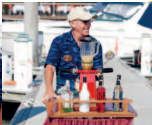
Complimentary summertime afternoon cocktails delivered to your boat