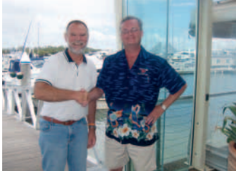
Local fishing guru "Stinker's" complimentary fishing clinic